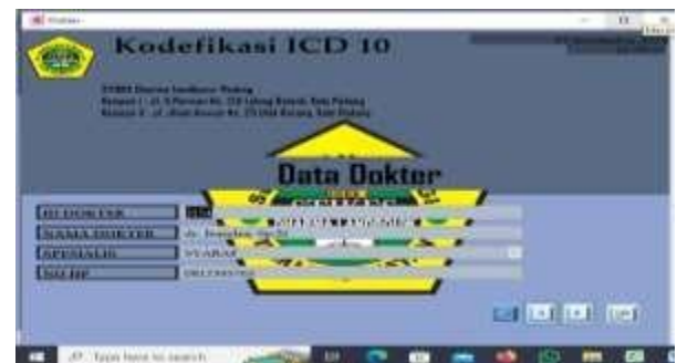
Figure 3. Display of Doctor Data Menu

The doctor form is a form used to input doctor data.