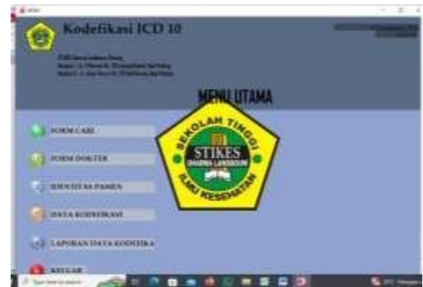
Figure 2. Main Menu Display

The main menu is a page used by users/students to select destination forms , such as patient identity, doctor data, search form , coding data and coding reports.