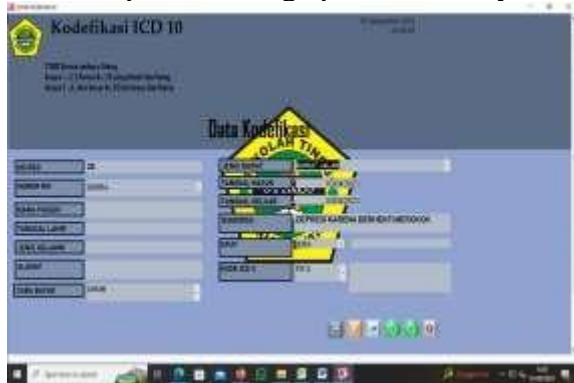
Figure 4. Codefication Data Display

This form is a form for adding codefication data whose results will become a codefication report, patient data for this codefication data is taken from data that has been inputted through patient Identity data.