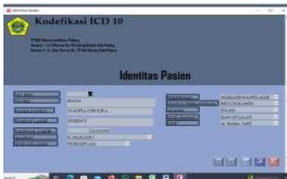
Figure 5. Display of Patient Identity Data

The identity form is a form for adding patient data where this form will later be connected to the codification data form .